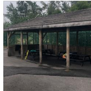
Zone A Year 4