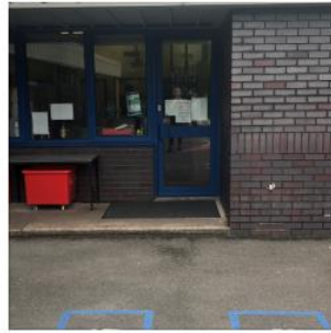
Year 1 External entrance