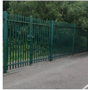
Side entrance gate for Year 1 and 2