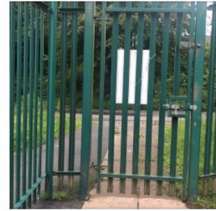
Reception top Gate