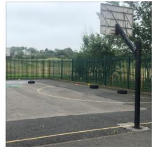
Zone B Year 5