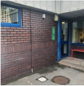
Year 2 External entrance